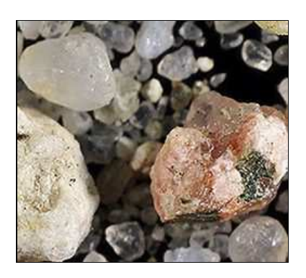
Opportunities, needs and challenges for raw materials