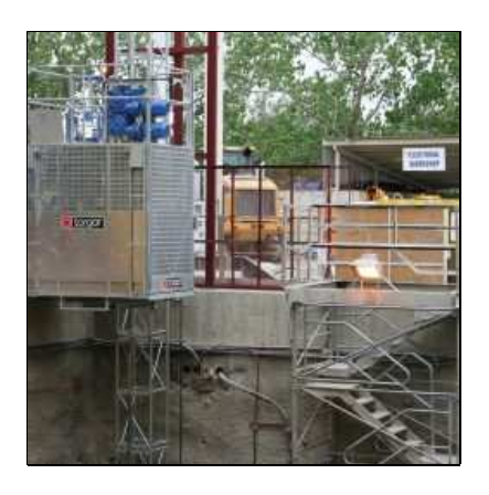
SA French supplies Saltec passenger hoists to Zambian mines